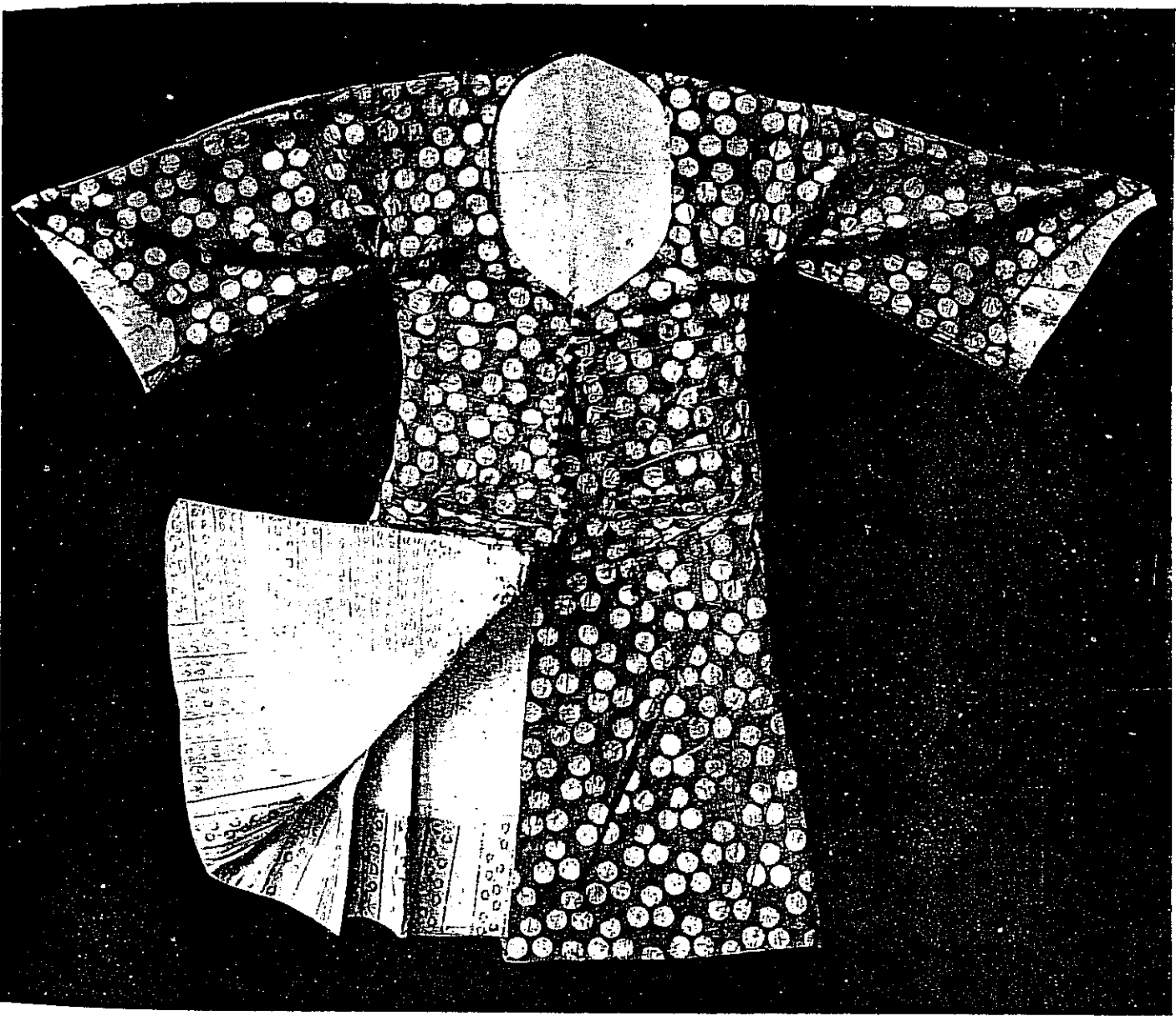
XVI. Pl. No. 4628 (Tks.)

blue shat silk & silver & gold dots (mounted)